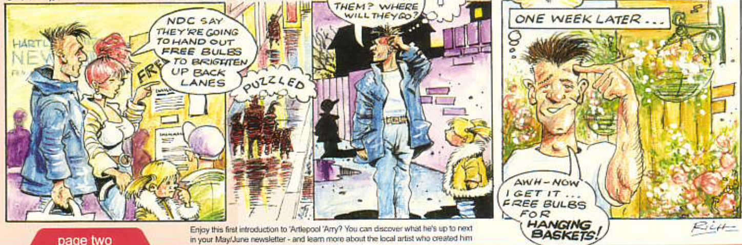
Enjoy this first introduction to 'Artlepool 'Arry? You can discover what he's up to next in your May/June newsletter - and learn more about the local artist who created him