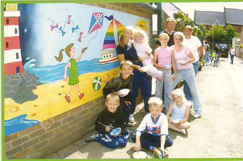
Residents get Creative

NDC parents and children have come over all creative in a project to make their streets a nicer place to live. Eight children aged between 4 and 14 painted two murals which were placed on garages in the Stockton Road area to make their back lane look nicer.